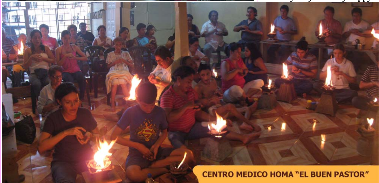
CENTRO MEDICO HOMA "EL BUEN PASTOR"