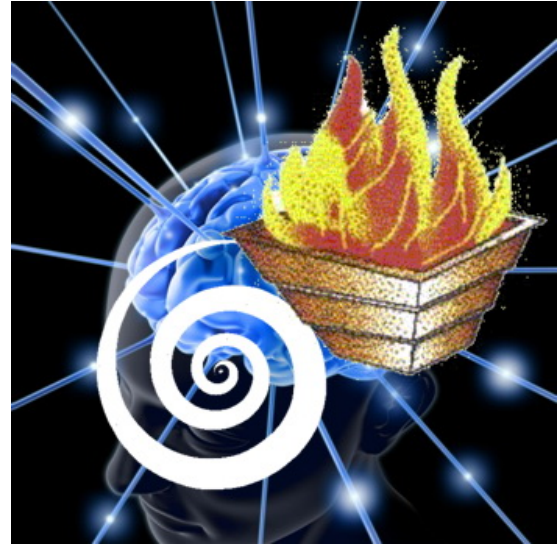
AGNIHOTRA quiets the mind

Our Solar System is also moving around another center and so on. Independently of these planetary movements, we are moving at a fast pace. We are rushing everywhere to do some work, fulfill a task or meet a dead line, yes, a dead line. This can create some stress which can affect our sleeping pattern. This is simply part of life. However, sooner or later we want to rest and take a break. We need to stop and recharge. So we take a vacation, where we just change our regular activities into recreational activities. Sooner or later, we acknowledge that a