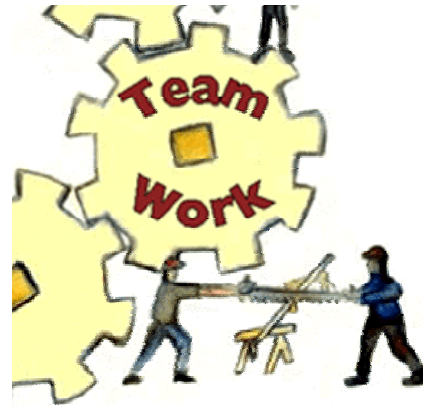
Team work makes it easier.

Fortunately we are also experiencing a new trend of thought as we get into this New Age.