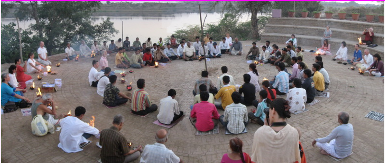
Photo above: After a good days' work, Agnihotra is a wonderful tool to calm down and relax completely in order to have fresh energies for evening singing and dancing!